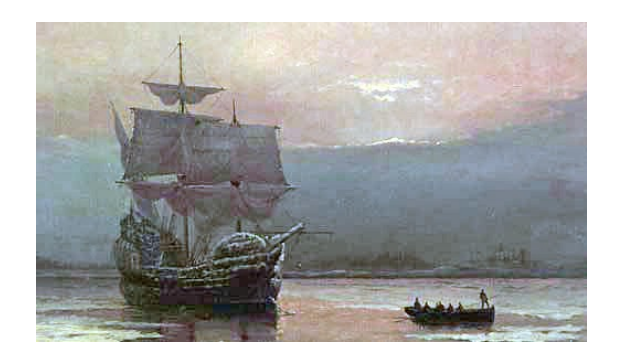
Mayflower in Plymouth Harbor by William Halsall (1882)

Video on Youtube: Deconstructing History: Mayflower (2'42) \rightarrow https://www.youtube.com/watch?v=w59TkoL-tZY