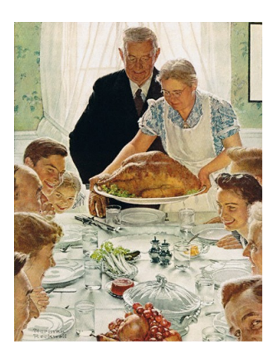
Freedom from Want, The Thanksgiving Picture or I'll Be Home for Christmas by Norman Rockwell (1943)