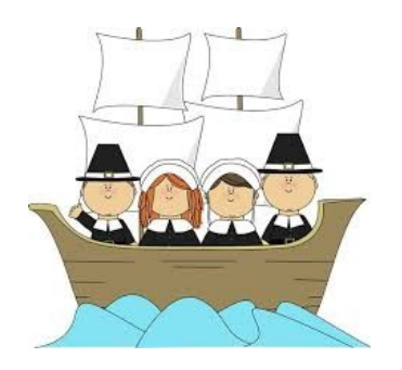
The Pilgrims in the Mayflower